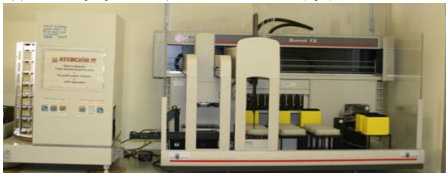
Fig.2. Equipment determined to develop the Cherry Picking process due to its specifications: Carrousel, grippers and Vspan® head

> For this new process the robot selected for the development of the application and Workflow was determined to be a BiomekFX + Cytomat platform due to its availability in the lab and the capability of this equipment to manage high numbers of plates without human interaction (Fig. 2).